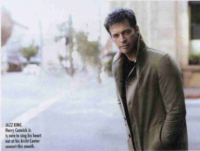
JAZZ KING Harry Connick Jr. is sure to sing his heart out at his Arsh Center concert this month.

feature 70 galleries from around the world, and the focus will be on street art, murals, pop surrealism and genres mastered by local artists. Times vary. Tickets $25. The Art Wynwood Pavilion, 3103 NE First Ave., Miami, 800.376.5850, artwynwood.com