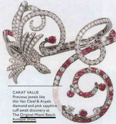
CARAT VALUE Precious jewels like this Van Cleef & Arpels diamond and pink sapphire cuff await discovery at The Original Miami Beach Antique Show.

Program II of the Miami City Ballet includes La Source by Balanchine and Delibes ; a company premiere of the Barber Violin Concerto; and In the Upper Room , with music by Philip