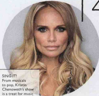
SING IT! From musicals to pop, Kristin Chenoweth's show is a treat for music lovers of all kinds.