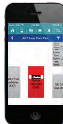
Exhibit Hall Map Booth Background

Sponsor's booth space background is colored on the interactive exhibit floor map.