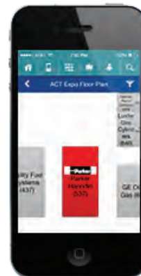
Exhibit Hall Map Booth Background

Sponsor's booth space background is colored on the interactive exhibit floor map