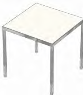
Chrome Square Table

30" x 30" x 30" Advanced $184.65 Standard $215.60 Quantity _____